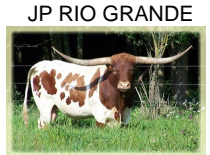
JP RIO GRANDE