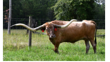
HORSESHOE J EXAMPLE