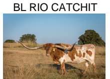
BL RIO CATCHIT