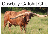
Cowboy Catchit Chex