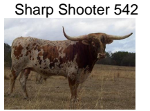
Sharp Shooter 542