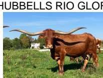
HUBBELLS RIO GLORY